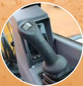
5. HYDRAULIC PILOT CONTROLS WITH PATTERN-CHANGE SELECTOR