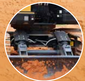
8. BOOM AND STANDARD, STRAIGHT BLADE CYLINDER GUARDS ON ALL MODELS PLUS THE SY35U HAS BLADE FLOAT