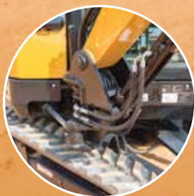
1. SWING BOOM FUNCTIONALITY