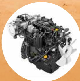
2. SY35U HAS A FLOW DIVIDER