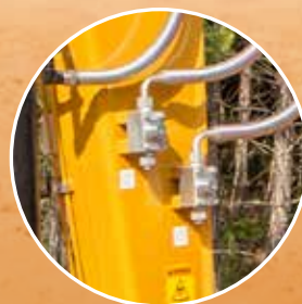
3. PRIMARY AUXILIARY CIRCUIT WITH 1- AND 2-WAY FLOW PLUS A SECONDARY AUXILIARY CIRCUIT ON THE SY50U AND SY80U