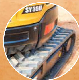
4. TRUE ZERO TAIL SWING ON SY16C/26U/35U/50U, WITH SY80U OFFERING REDUCED TAIL SWING