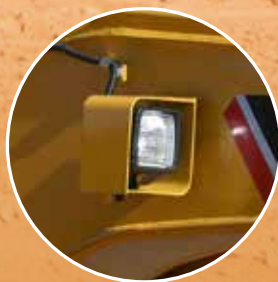
6. THUMB-READY STICK