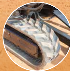
7. RUBBER TRACKS FOR GROUND PRESERVATION ON ALL MODELS WHICH ARE RETRACTABLE UP TO 34" ON THE SY16C